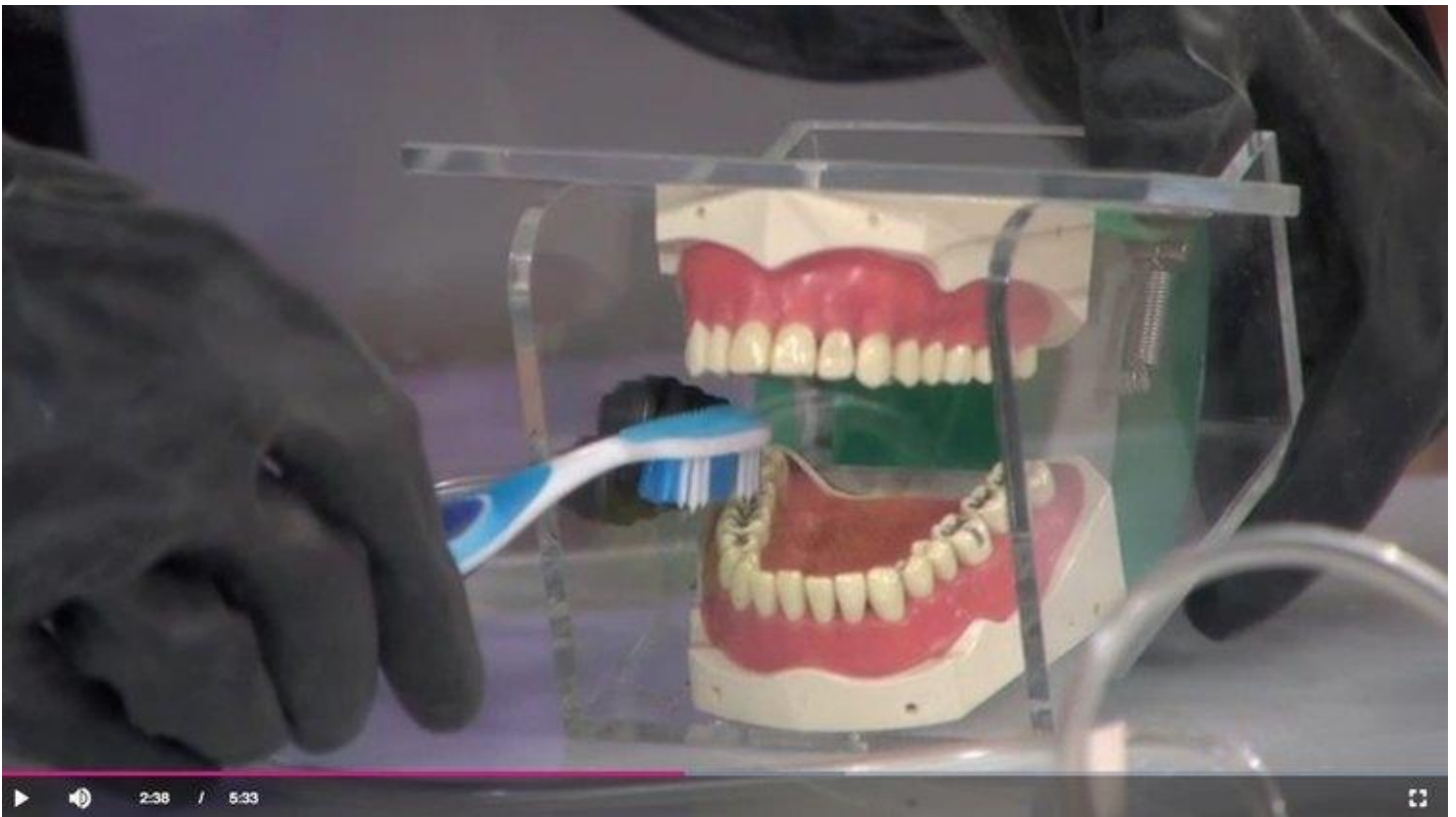
In this episode " Toxic Teeth: Are Mercury Fillings Making You Sick? " Dr. Oz brushes mercury amalgam fillings with a toothbrush for 60 seconds. Everyone watching could see that just normal brushing released more mercury vapor than is deemed safe by the EPA.